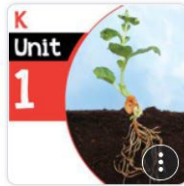
Teacher's Resource System Unit 1 (Gr. K)