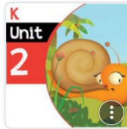
Teacher's Resource System Unit 2 (Gr. K)