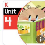
Teacher's Resource System Unit 4 (Gr. K)

Feel free to contact us at techsupport@benchmarkeducation.com or call us at 855-245-9751 with any questions or assistance.